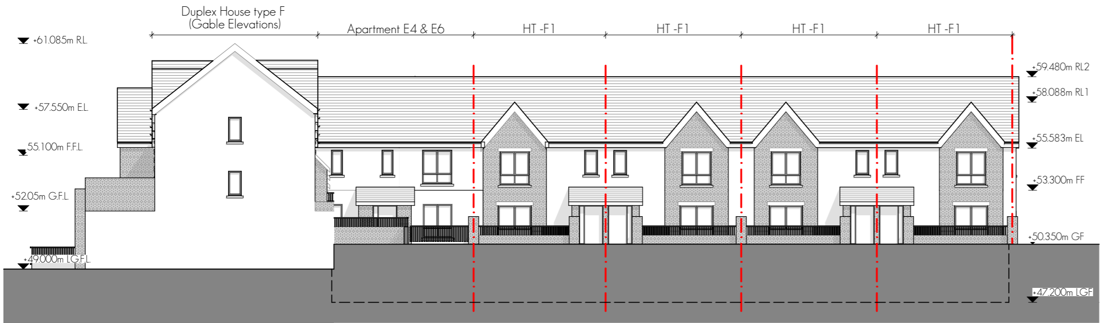
Contextual South Elevation (Front)

THIS DRAWING IS FOR PLANNING PERMISSION PURPOSES ONLY. FURTHER DRAWINGS AND STUDIES WILL BE REQUIRED FOR CONSTRUCTION AND TO ENSURE COMPLIANCE WITH RELEVANT BUILDING REGULATIONS AND STANDARDS. NOTE: PLEASE REFER TO THE SITE LAYOUT DRAWING FOR ALL FFLS AND THE NORTH POINT ORIENTATION