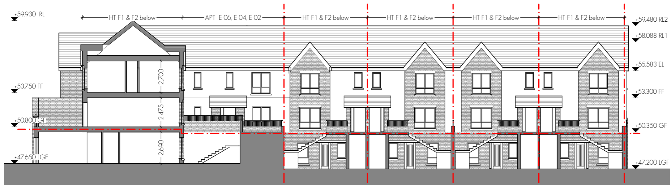
Contextual South Elevation (Front) - showing lower level